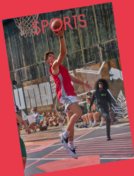
be active, watch pro-athletes compete at contests and find new passions in multiple sports activities