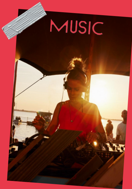
multiple music stages, showcasing a diverse range of music acts