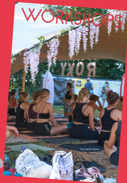
diverse diy workshops, placed all over the festival grounds