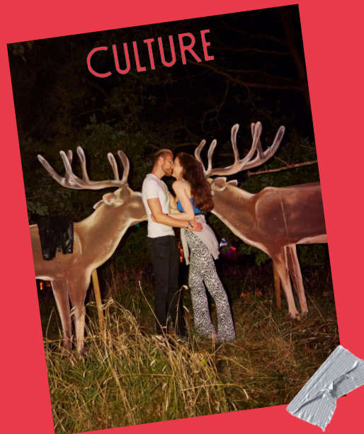
a place full of love, solidarity and productivity